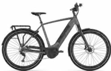
dust light mat