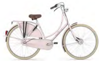
powder rose mat