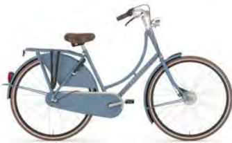
jeans blue mat