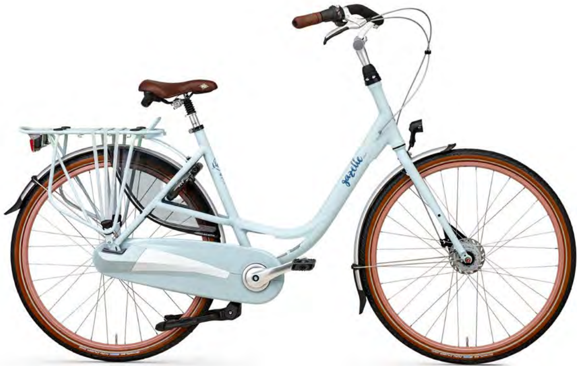
iced blue mat