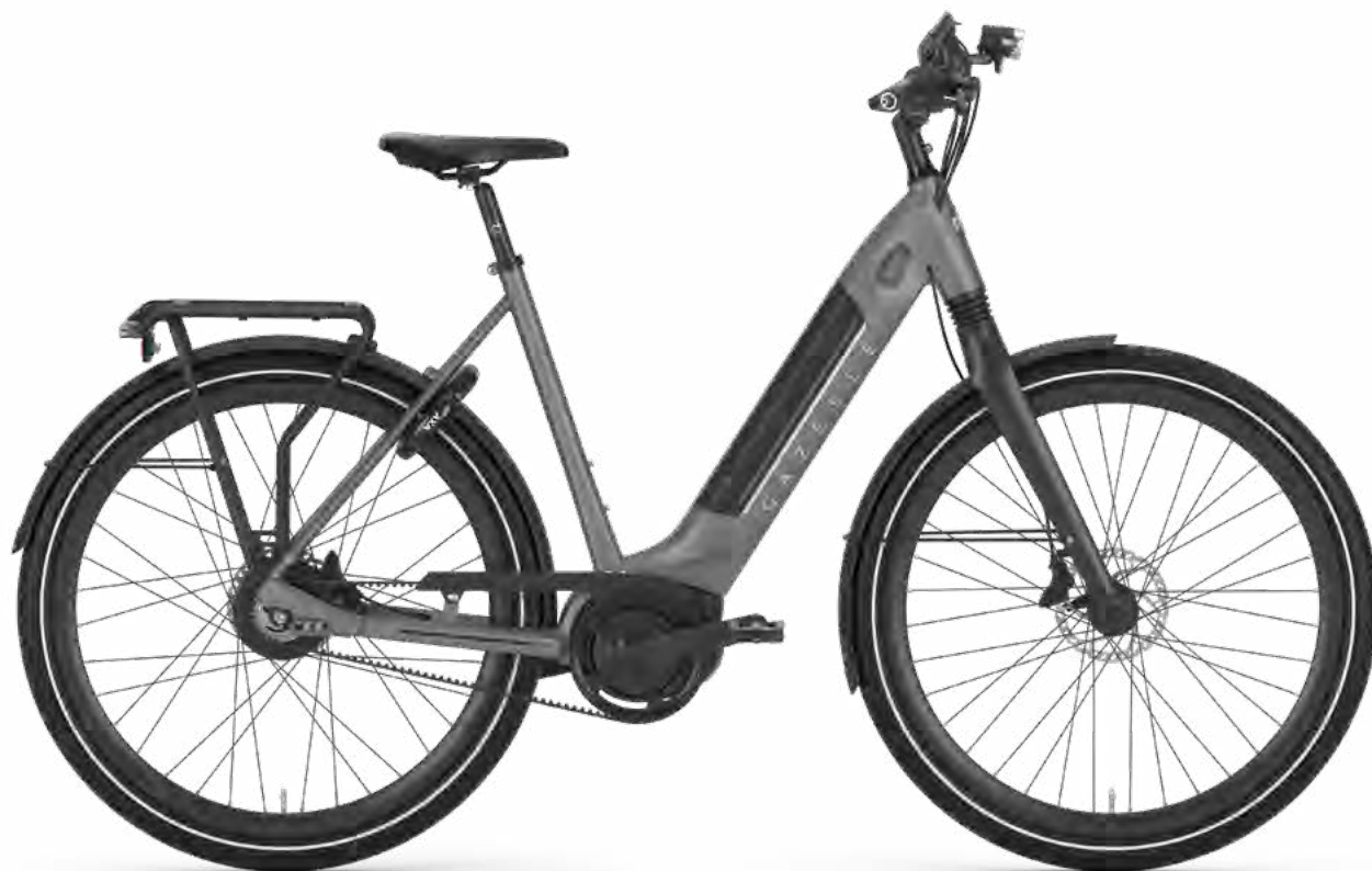
magnum grey mat