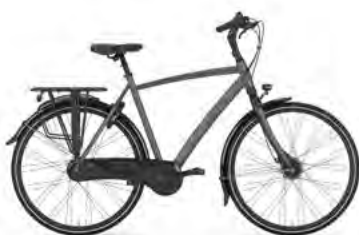
iced coffee brown mat

Relaxed cycling in an active posture. That is what this all-rounder with its lightweight aluminium frame is intended for. With 8-speed gears, you will be off to a quick start at the traffic lights and really get a move on out of town. The Chamonix boasts a particularly sporty look and the use of the special chain case plus chain tensioner means your chain will always be tensioned correctly.