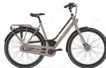
moon rock mat