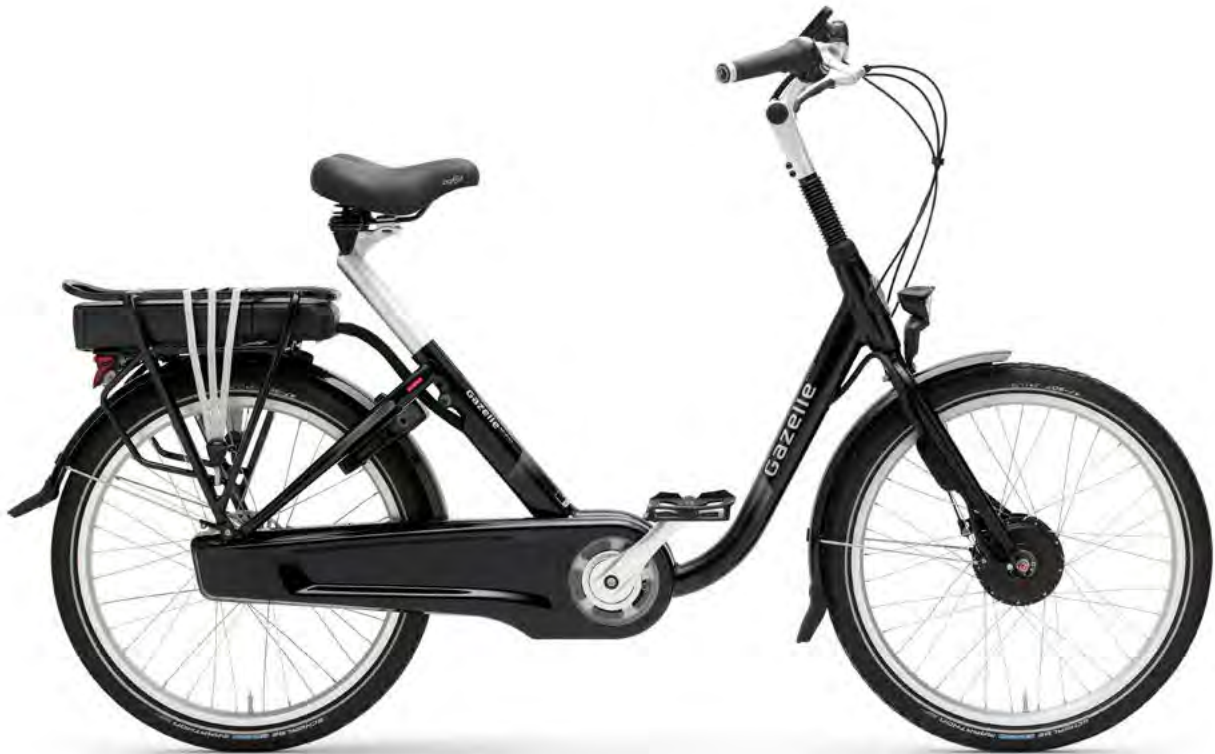
panther black glossy