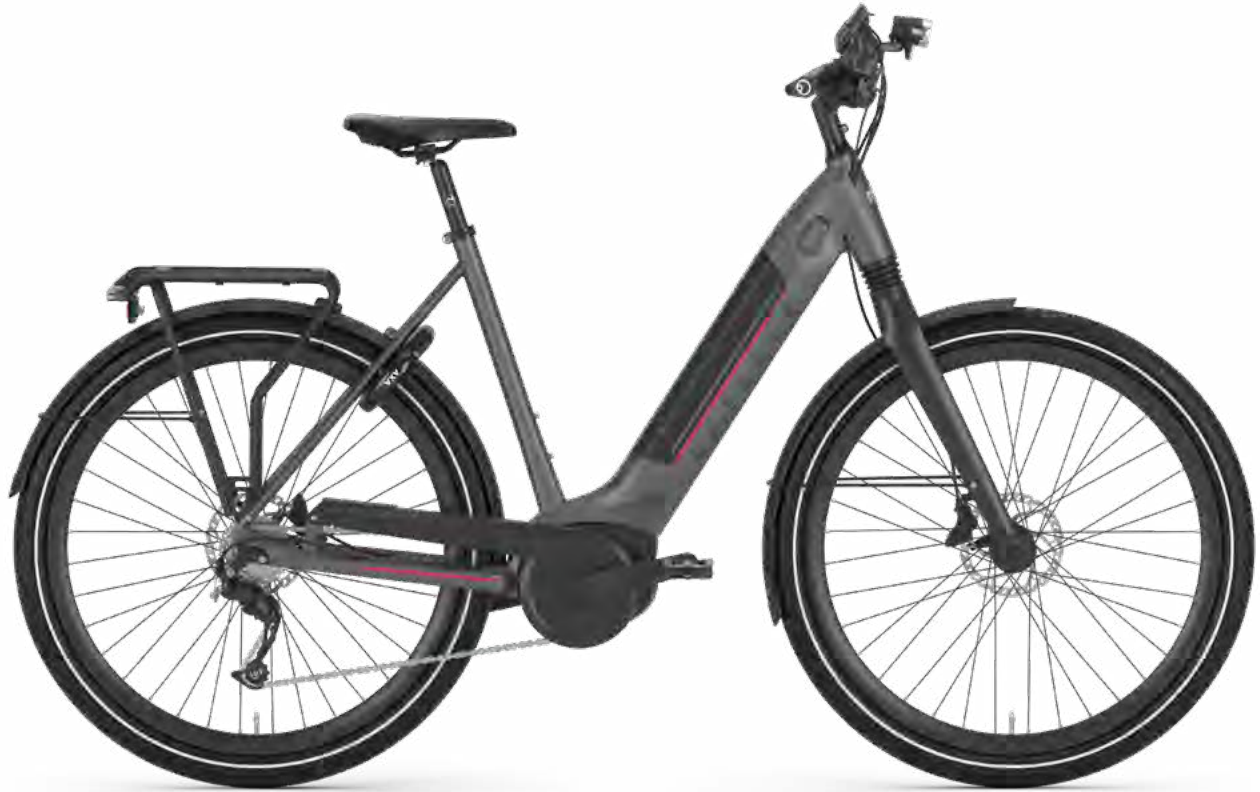
dust light mat