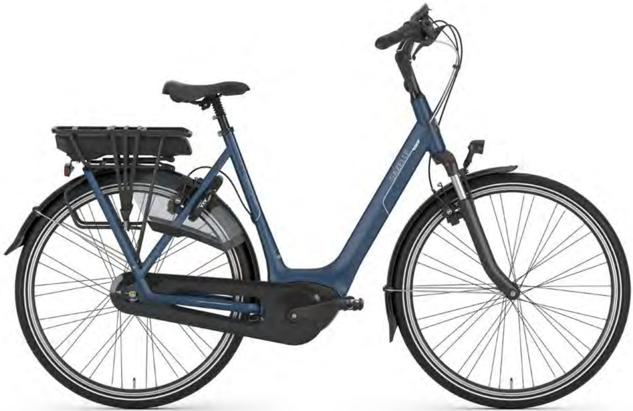
mallard blue mat