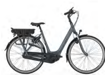
legion blue mat

The striking Gazelle Orange design is appealing. And you want a suitable model for the ride to work, the groceries and sometimes a nice bike ride. With pleasant support, comfort and ease of use. In short, a real Gazelle Orange.