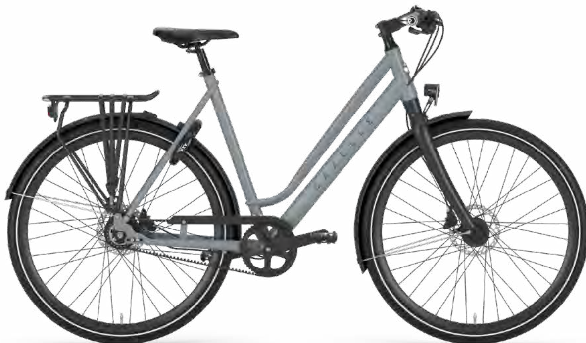
brewster grey mat