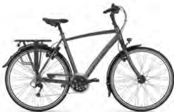
desert titanium grey mat