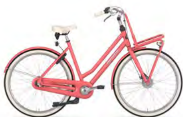
georgia peach mat