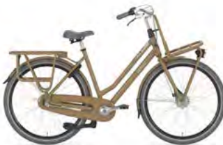
harvest gold mat

The HeavyDutyNL has all the features of a delivery bike for heavy work. You can easily take a lot with you on its robust front and rear carriers. The pedal effort on this delivery bike is nonetheless nice and light. This is due to the fact that its designer frame and both carriers are made of aluminium. And the wide tyres absorb all the bumps.