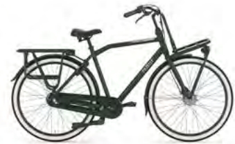
hunter green mat