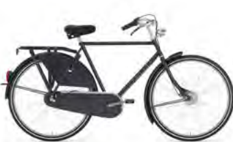
panther black glossy