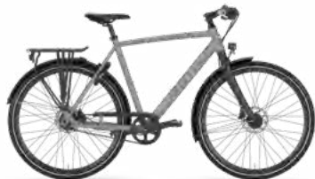
brewster grey mat

The Marco Polo Urban is ideal for use in town and the surrounding area.