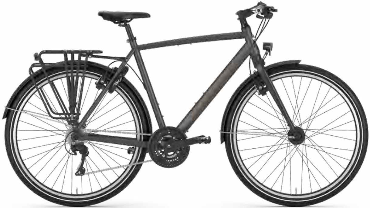
hot coffee mat