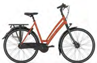
bossa nova mat

Gazelle's Chamonix C7 combines the positive features of this model range – sporty and comfortable cycling – with a stylish design. The black rims go nicely with the matt paint colours. With its 7-speed gears, chain case with automatic chain tensioner and hub dynamo, it is a robust low-maintenance all-rounder.