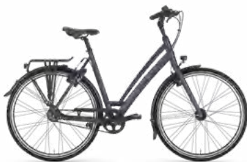
meteor grey mat