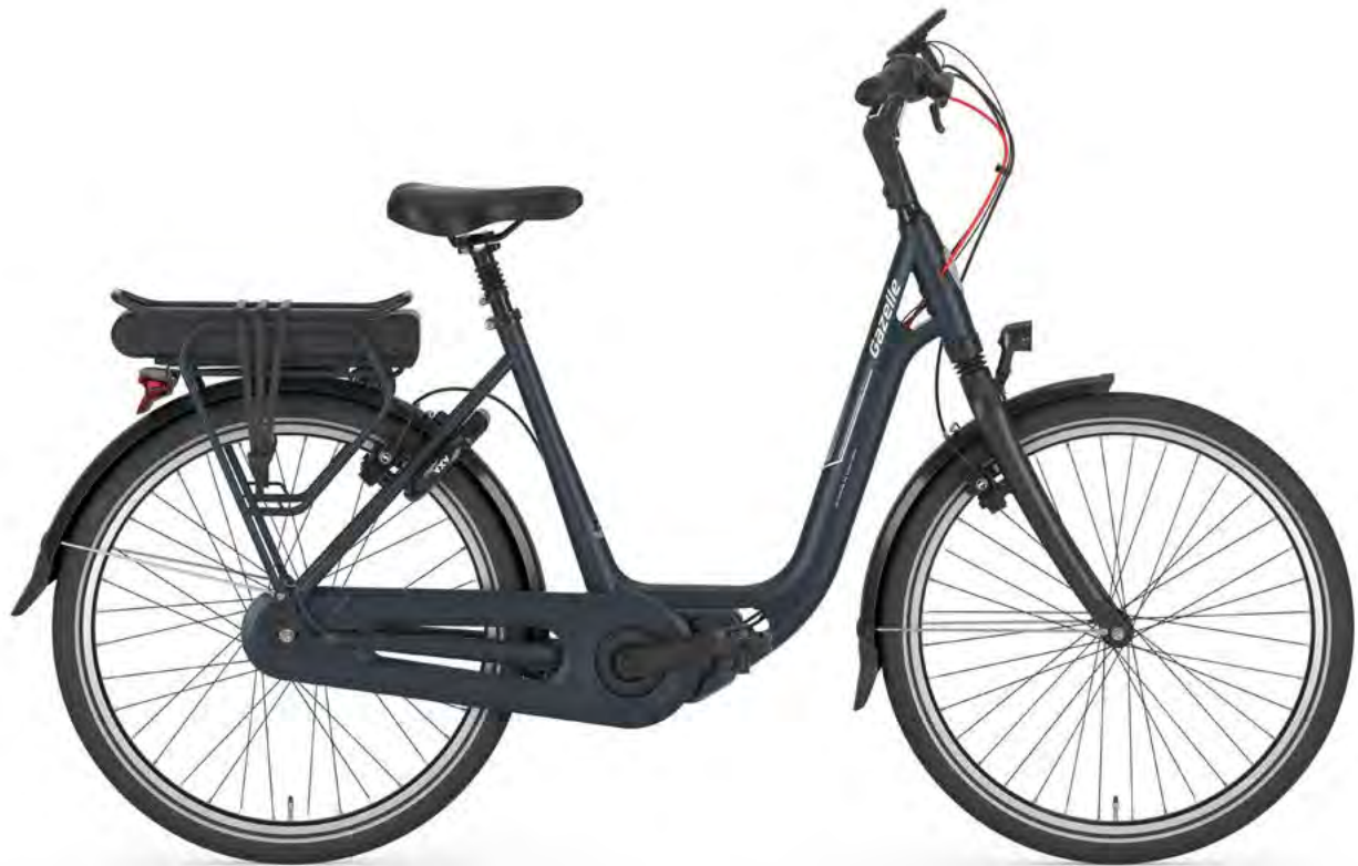
meteor grey mat