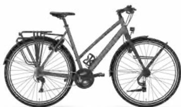
dust light mat

Enjoy and cycle without limits. Adventure calls: you will want to discover the most beautiful spots, at one with your bike and the scenery. Depending on nothing and no-one, since you have everything with you. The very best material is a job half done. Light and strong, tried and tested, high-end and meticulously assembled are at the top of your wish list. Then it all points to a hand-made Gazelle Marco Polo Travel.