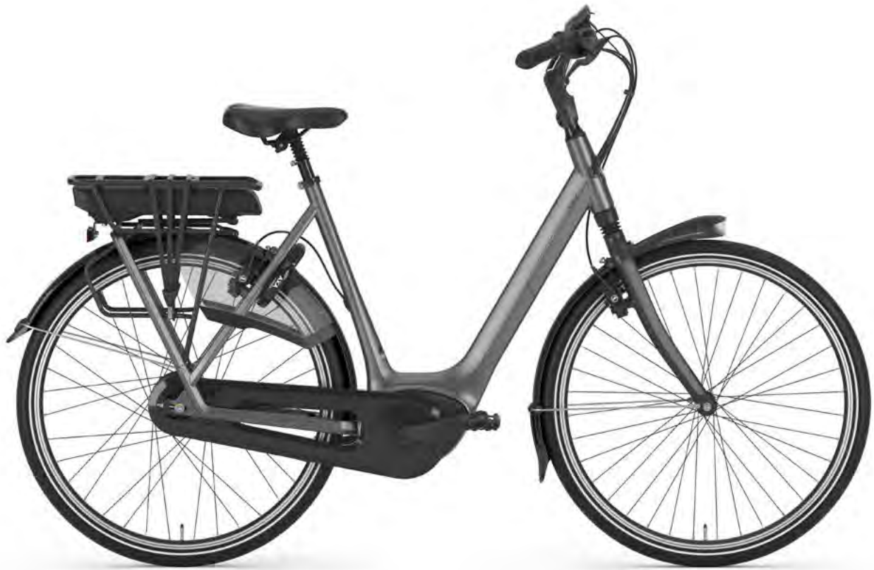
aluminum grey mat