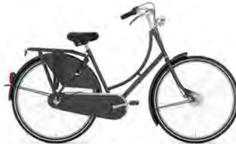
panther black mat