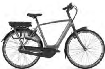
aluminum grey mat