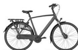
eclipse black mat

This Gazelle fulfils all your wishes, both in town and on a longer touring ride. And stylish colours give the Orange C7+ timeless appeal. It is not without good reason that it is Gazelle's best-selling urban bike.