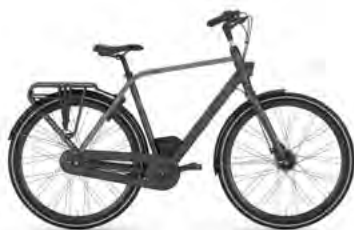
eclipse black mat