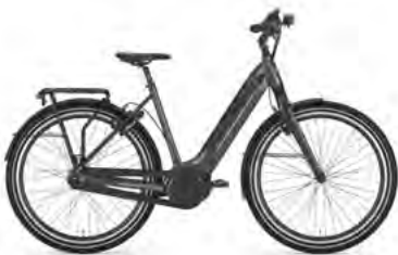
desert titanium grey mat