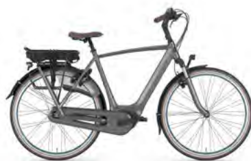
aluminum grey mat

With the Gazelle Orange C7 HMB you can cover long distances easily and comfortably. The 40 Nm high Bosch mid-mounted motor is ideal for a daily rider. And the side display puts everything under control.