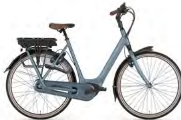
mirage blue mat

State of the art in effortless cycling. Luxury all around: you sit on a gel saddle and a suspension seat post. While pedalling, you shift smoothly from the lowest to the highest gear and back. Stepless, because you feel exactly when you are in the right gear. An ideal combination with the powerful mid-mounted motor.