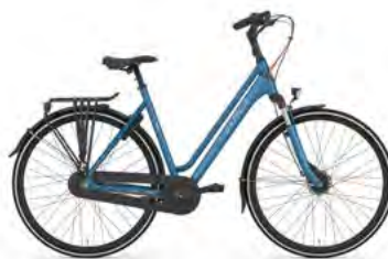
avalon blue mat

The Vento C7 is a versatile lightweight urban bike in a sporty design. Its resilient suspension front fork and seatpost enhances your cycling comfort. This Gazelle needs hardly any maintenance thanks to its cables integrated into the frame, enclosed chain case and hub dynamo. All this in a good value-for-money package.