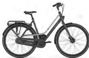
eclipse black mat

CityGo is Gazelle's answer to busy urban traffic and full cycle parking: a striking presence with a contrasting colour top tube, LED lighting integrated into the frame and an optional innovative front carrier. A bike that can take the occasional knock and needs almost no maintenance.