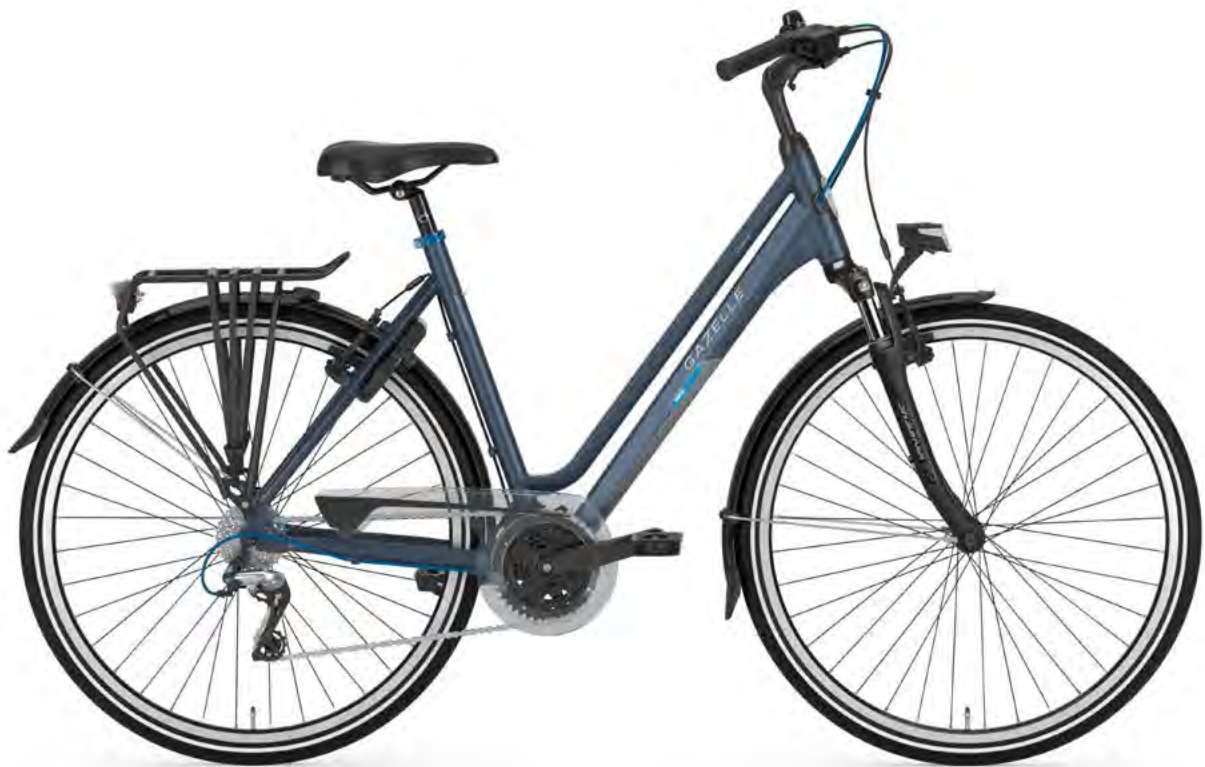
meteor grey mat