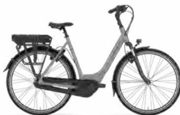
brewster grey mat

With the new Paris C7+ HMB, Gazelle has demonstrated convincingly that a top-quality e-bike can also be achieved on a limited budget. With the Paris C7+, Gazelle designers have added a little extra: increased assistance, more comfort and greater ease of use.