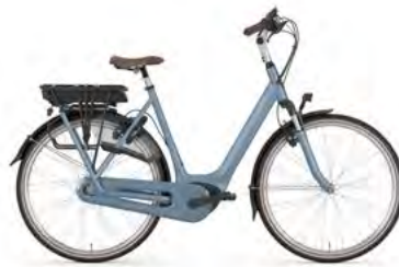
jeans blue mat