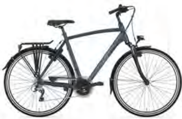
meteor grey mat