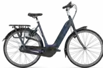
mallard blue mat

This all-rounder with the extra powerful and silent Bosch mid-mounted motor is ideal for day-to-day trips as well as long-distance rides. The motor provides effortless assistance, on both flat and hilly terrain.