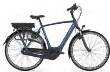
mallard blue mat