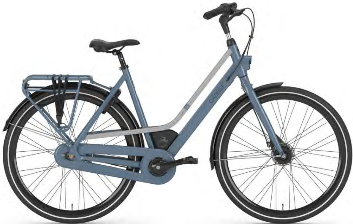
jeans blue glossy