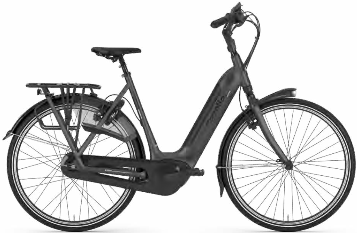
eclipse black mat