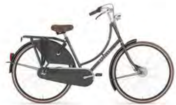
desert titanium grey mat

The Gazelle Classic with its low step-through frame has been steadily improved over the years. And now it's available in new colours. Paintwork and chrome, all the controls can take the occasional knock. The high-quality, nostalgic look is still there. And that will remain, even after many years of carefree cycling fun. And that's the big difference between our Classic and countless lookalikes.