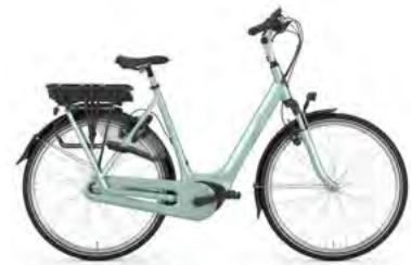
pale green glossy

No slope too steep for this versatile e-bike with a 40 Nm Bosch mid-mounted motor. Even daily use is easy. Everything is equally comfortable, with a suspension seat post and front fork. Convince yourself of the convenience and safety of the wide, low step-through frame.