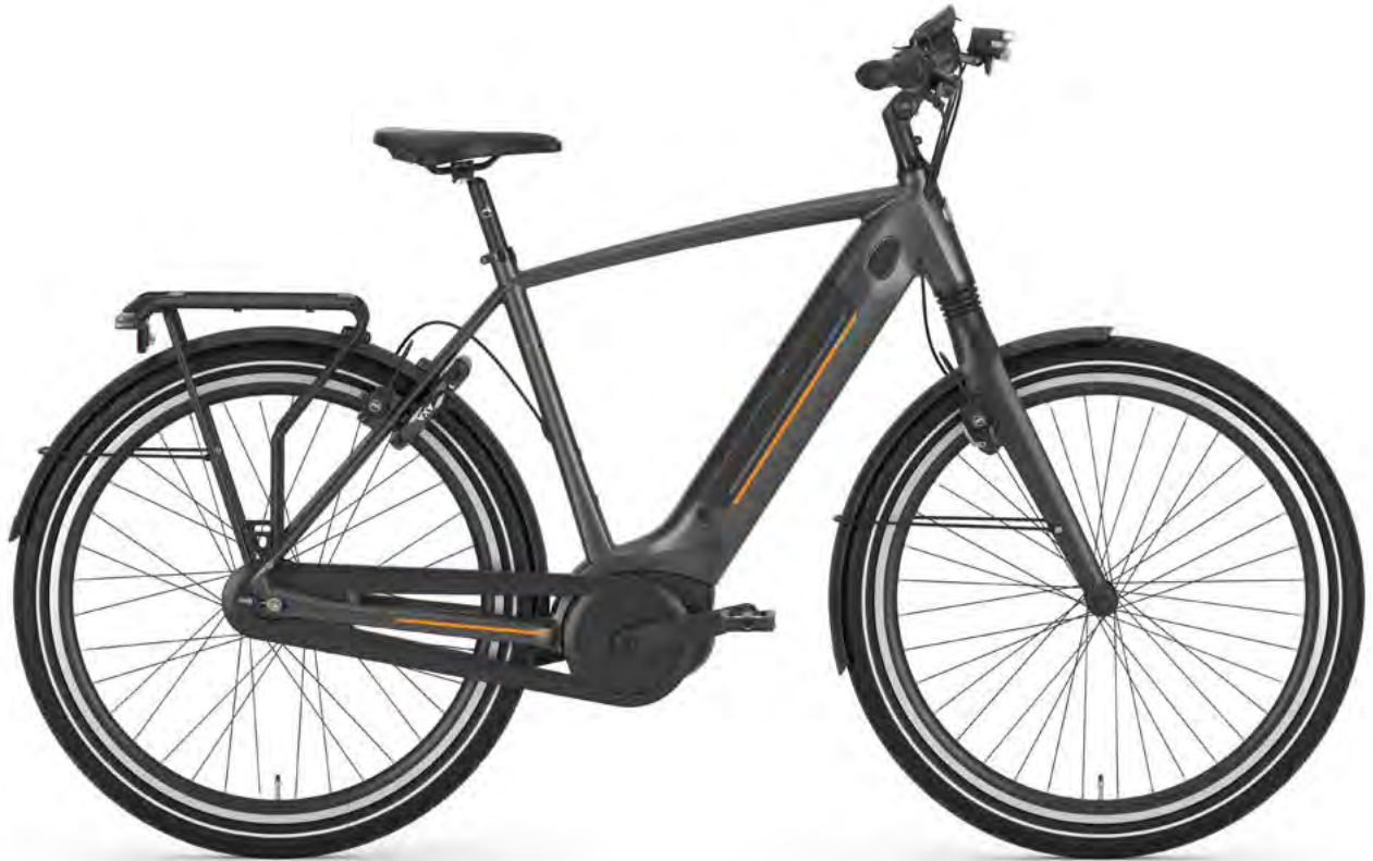
desert titanium grey mat