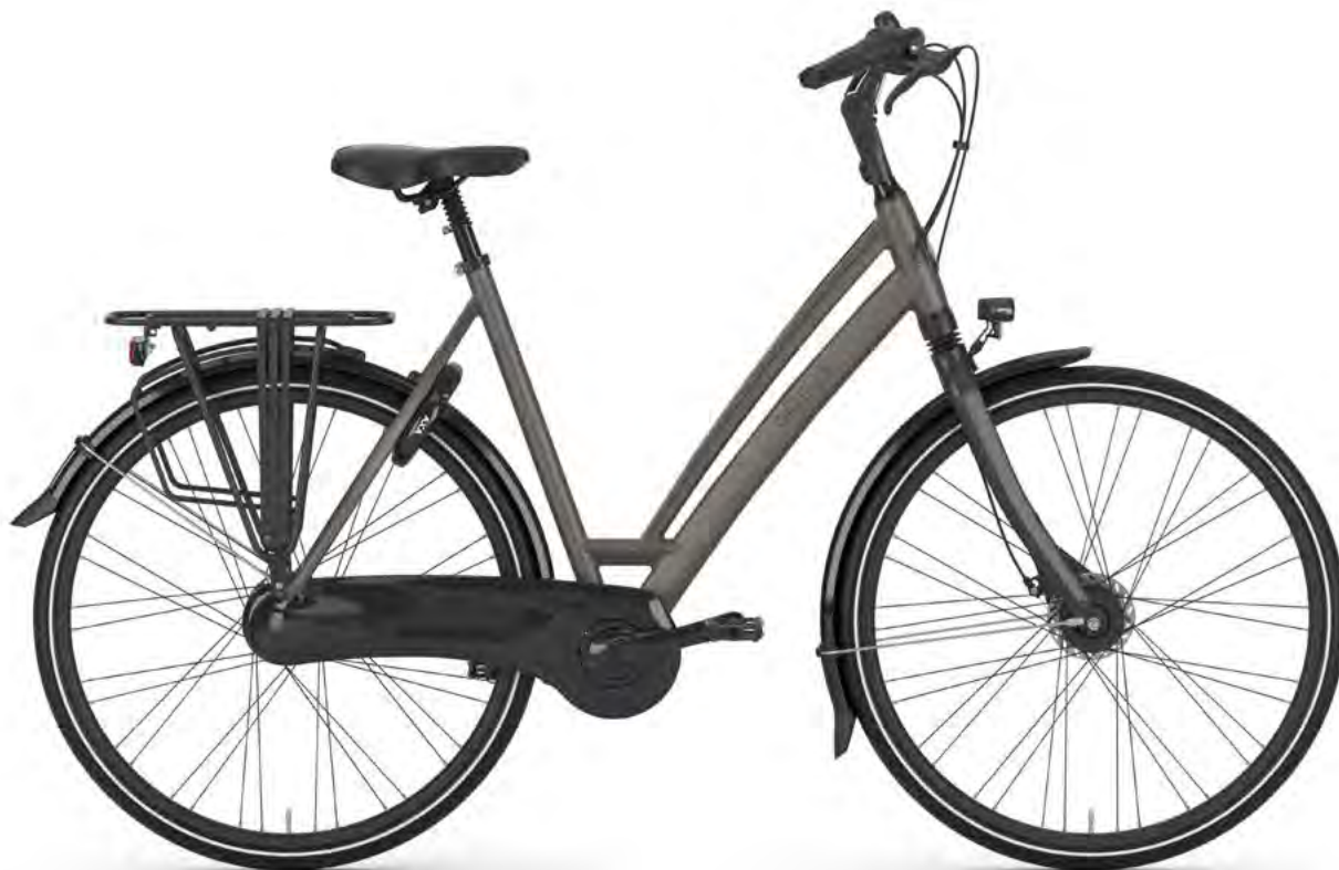
iced coffee brown mat