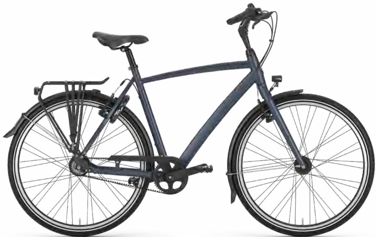
meteor grey mat