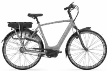
brewster grey mat

You sit on a gel saddle with your hands on leather handlebar grips. With no less than 60 Nm of assistance, you can shift smoothly from first up to fifth gear and back down again. And you do so in virtual silence thanks to the low-maintenance Gates belt drive. The ideal partnership between a powerful mid-mounted motor and state-of-the-art drive technology.