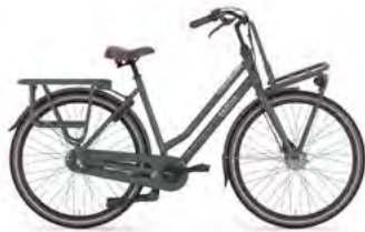
dust light mat