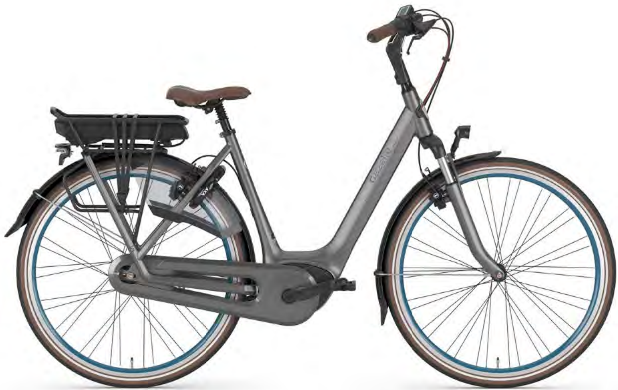
aluminum grey mat