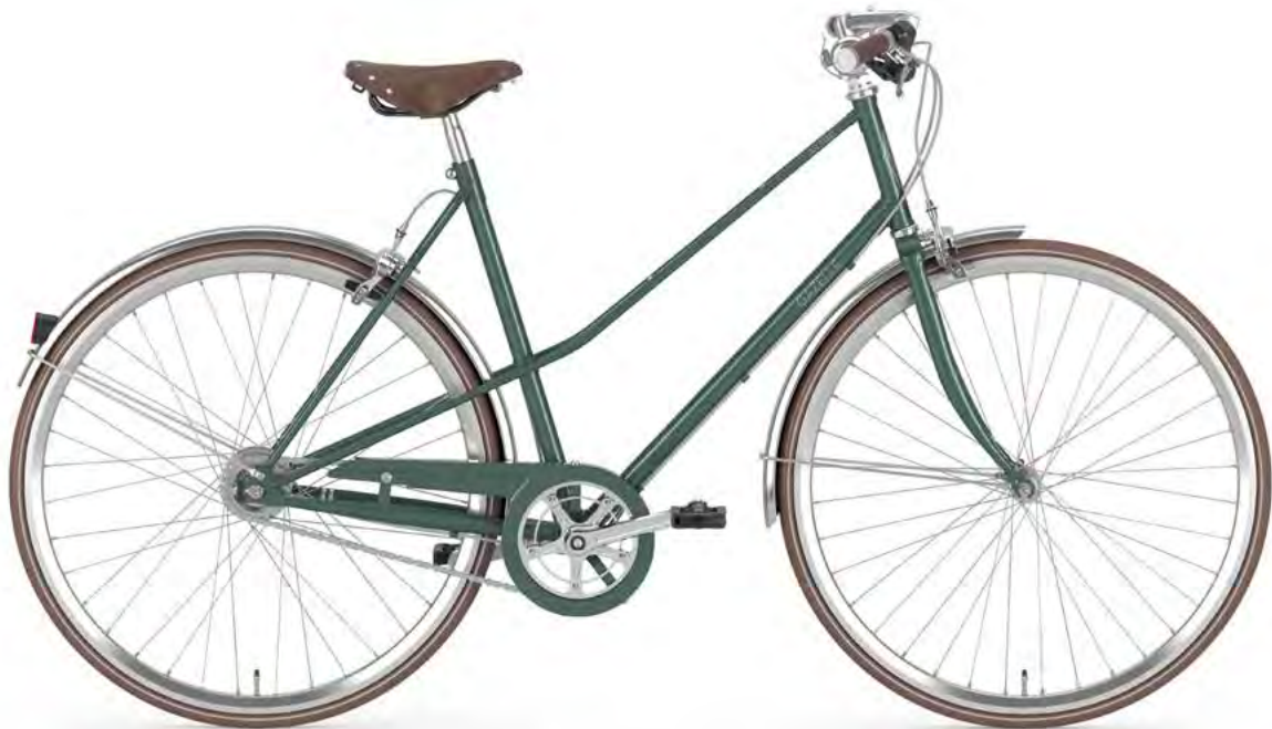
green eyes glossy