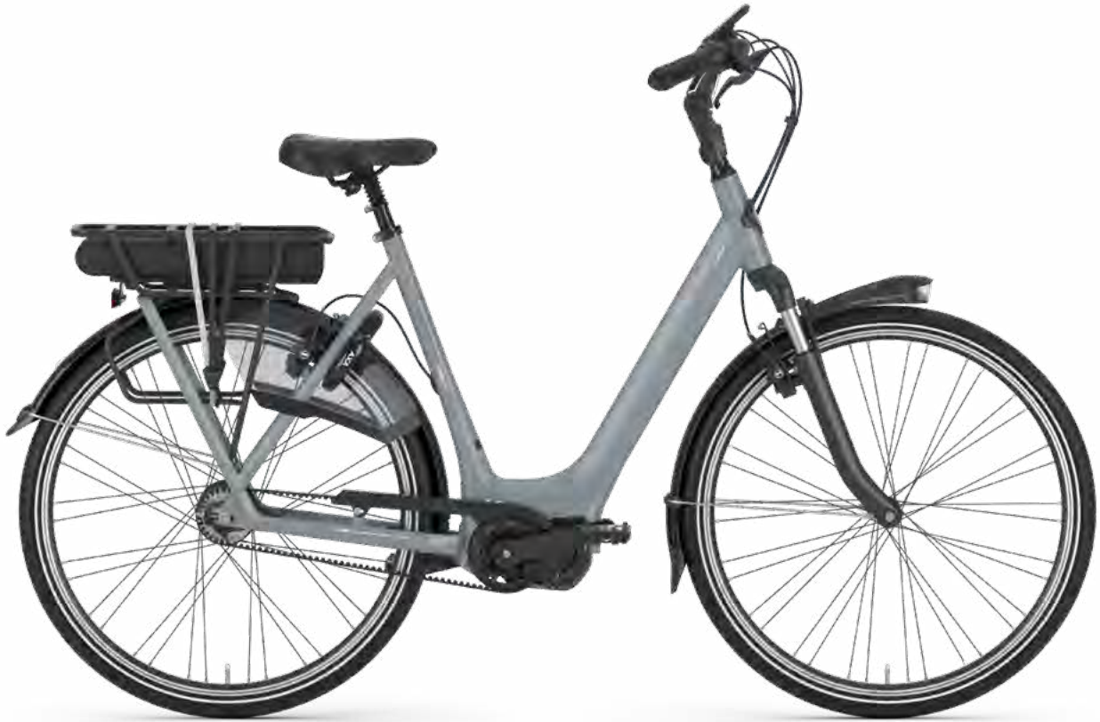
brewster grey mat