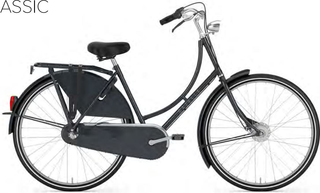
panther black glossy