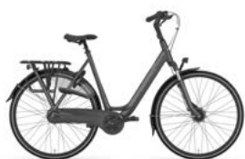
eclipse black mat