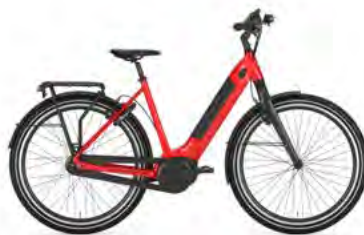
champion red glossy

The Ultimate C8+ HMB goes just like it looks: super comfortable and a sporty look. Characterised by its innovative and dynamic design, the Ultimate is a feast for the eyes. The Ultimate C8+ HMB is delightfully stable on the road thanks to a low centre of gravity and the stiffness of the frame. The leather handlebar grips, wide tyres and suspension front fork with integrated brakes provide added comfort. Sports cycling has never been so comfortable.